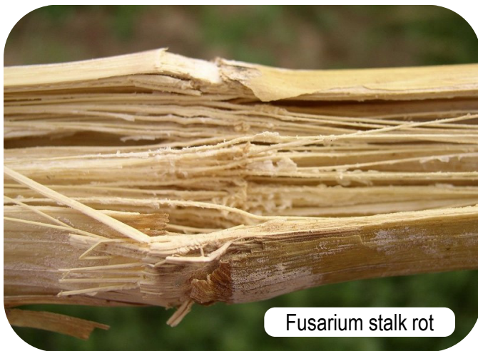
Fusarium stalk rot