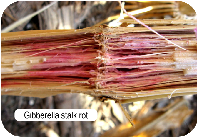
Gibberella stalk rot