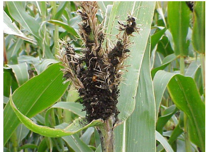
Figure 2. Tassel covered with sori of head smut. Individual florets are replaced by teliospores and leaf-like proliferations are present on affected tassels. Tassel will not normally produce pollen.

The fungus Sphacelotheca reiliana survives over winter as spores in the soil. Separate races have been recognized: one race limited to corn, and another that attacks sorghums and Sudan grass. Optimum conditions for corn germination and