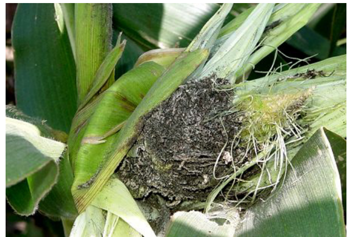
Figure 3. Plants affected with head smut develop a short round tear-drop shaped formation full of spores, instead of an ear. Remnants of the vascular system may be seen.