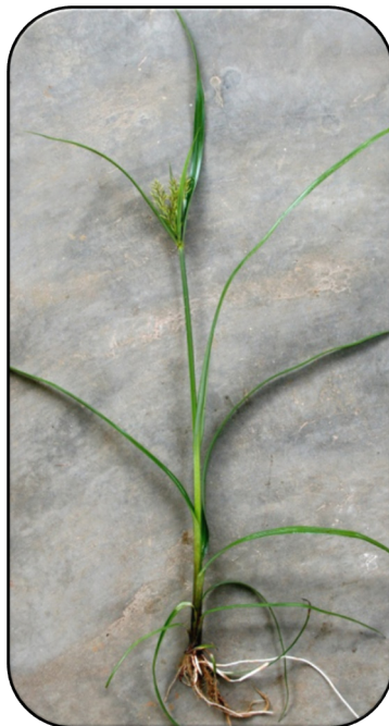
Yellow nutsedge is recognized as a major host