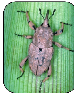
Southern corn billbug