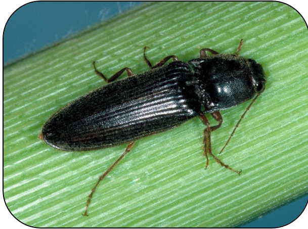
Adult wireworms, known as “click beetles”, are yellow, brown, black, or gray and slender with a bullet shaped abdomen