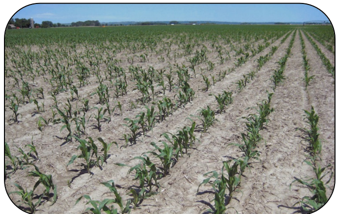
Missing plants due to wireworm feeding