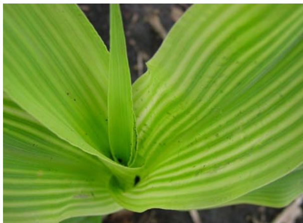
Yellowing between leaf veins is a symptom of sulfur deficiency in corn.

Sulfur fertility has historically not been a major concern for growers on most soils, as soil organic matter, atmospheric deposition, manure application and incidental sulfur contained in fertilizers have typically supplied sufficient sulfur for crop production. However, reductions in the amount of sulfur contributed by these factors combined with increased sulfur removal with greater crop yields have made sulfur deficiencies more common.