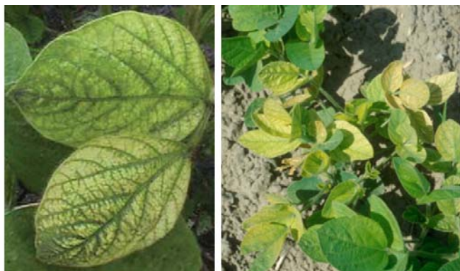
Figure 4. Interveinal chlorosis due to iron deficiency (left). Note the similar appearance to Mn deficiency (Figure 3) and stunted growth (right).

existing varieties as well as identify new varieties that can help growers overcome yield losses to IDC. Pioneer® brand varieties are rated on a 1 to 9 scale where 1 indicates poor tolerance and 9 indicates excellent tolerance. If growers are planting into an area with a history of IDC, they should select varieties with an IDC score of 6, 7 or 8.