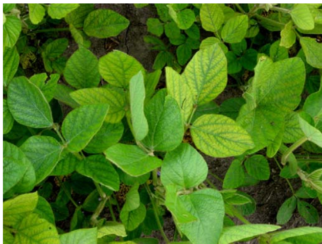
Figure 3. Manganese-deficient soybean plants. Uppermost (youngest) leaves show interveinal chlorosis while the veins remain green. Manganese is fairly immobile in the plant rendering symptoms on the newest leaves.

Manganese (Mn) - One of the more common micronutrient deficiencies observed in soybeans is manganese (Mn). Manganese deficiencies are most likely to occur in coarse, dry, high pH and high organic matter soils. Manganese deficiency symptoms include interveinal chlorosis on the newest (topmost) leaves (Figure 3).