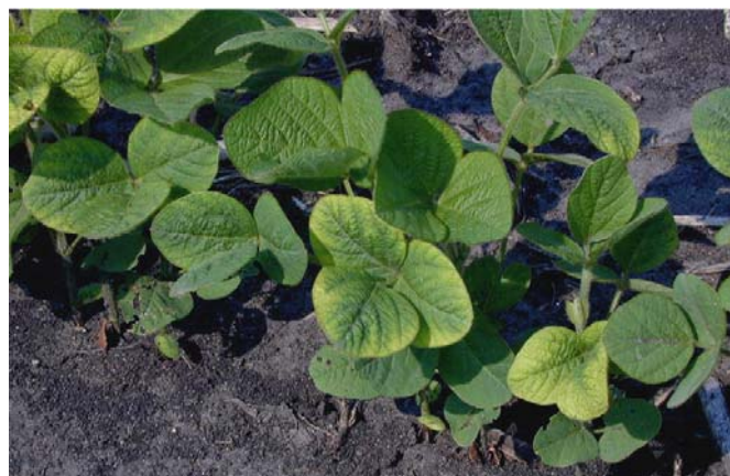
Figure 2. Potassium deficiency in soybeans. Note the yellowing pattern beginning at the leaf margins.

Symptoms of K deficiency include yellowing of the margins of the leaves, starting with the older, lower leaves (Figure 2).