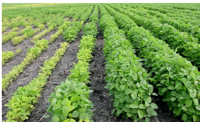
Figure 5. Pioneer research plot showing extreme varietal differences in iron deficiency chlorosis tolerance.

Increased Plant Population – Another management practice that has resulted in higher yields in IDC areas is increased plant population. Scientists suggest increasing plant density to 200,000 plants/acre in 30-inch rows in chlorotic field areas. Using GPS systems to map affected fields, and variable-rate seeding equipment to vary seeding rates in affected vs. non-affected field areas could increase the efficiency of this management strategy.