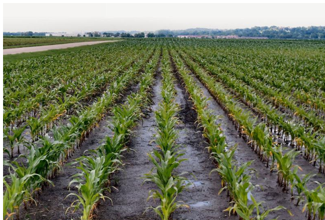
Figure 2. Severe nitrogen deficiency symptoms are evident in this field that remained saturated due to excessive rainfall.

Nitrogen may be applied by growers at several times during the year: in the fall, early spring (preplant), at planting, and in-season (sidedress).