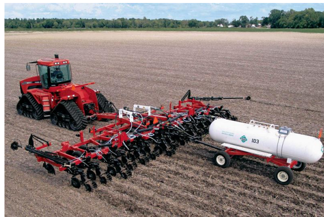
Figure 4. Application of anhydrous ammonia to field previously in soybeans. A nitrification inhibitor can be added to reduce N losses, especially for fall application.

naturally occurring soil enzyme involved in the conversion of urea to ammonia. This allows more time for rainfall to occur and incorporate the urea into the soil. Agrotain Ultra is a more concentrated formulation of Agrotain.