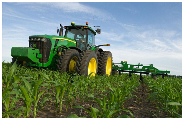
Figure 3. Sidedress application of anhydrous ammonia at the V5 to V6 corn growth stage.

As Table 2 shows, the most common result of the N timing studies was no difference in corn grain yield between preplant and split application times. In Iowa and Wisconsin, preplant applications were equal or superior to split timings