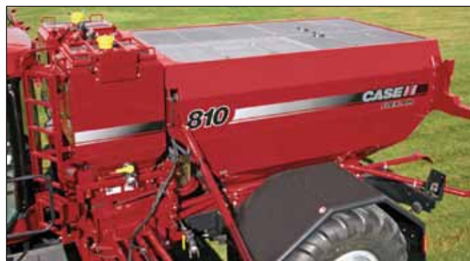
New equipment advances allow for accurate fixed-rate or variable-rate application of dry fertilizer.