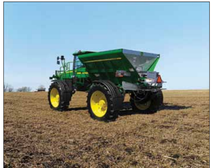
Fertilizer P and K are often broadcast-applied in the fall following soybean harvest.

BUILD AND MAINTAIN fertility programs contrast with the nutrient sufficiency approach in that they are not intended to maximize economic returns in any given year. Rather, they are designed to provide flexibility and consistent economic returns over the long-term by removing P and K as yield-limiting factors. At low soil test levels, build and maintain recommendations focus on increasing P and K to the critical test level and maintaining soil nutrient supply at or above this point through application of additional fertilizer to account for crop removal (see Table 1 for critical levels and crop removal rates). Build and maintain programs also advise that fertilizer be applied to account for crop removal in the optimum soil test range. Generally, recommendations based on a build and maintain philosophy will provide 100 percent of maximum yield with low risk of yield loss due to insufficient fertility.