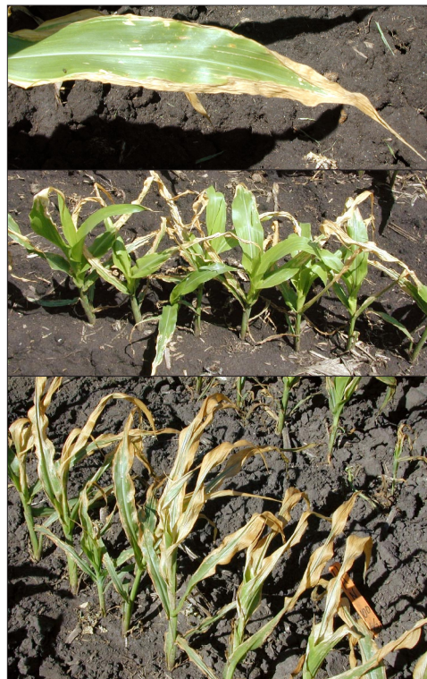
Broadcast solution nitrogen

Non-pressure nitrogen solutions (urea-ammonium nitrate solution, 28 or 32% UAN) broadcast on top of growing corn can burn leaf tissue. The solutions tend to move towards the leaf tip and margins, resulting in greater burning of those leaf areas. Corn plants usually outgrow the damage if only a portion of the leaves is injured. However, leaf damage and potential yield