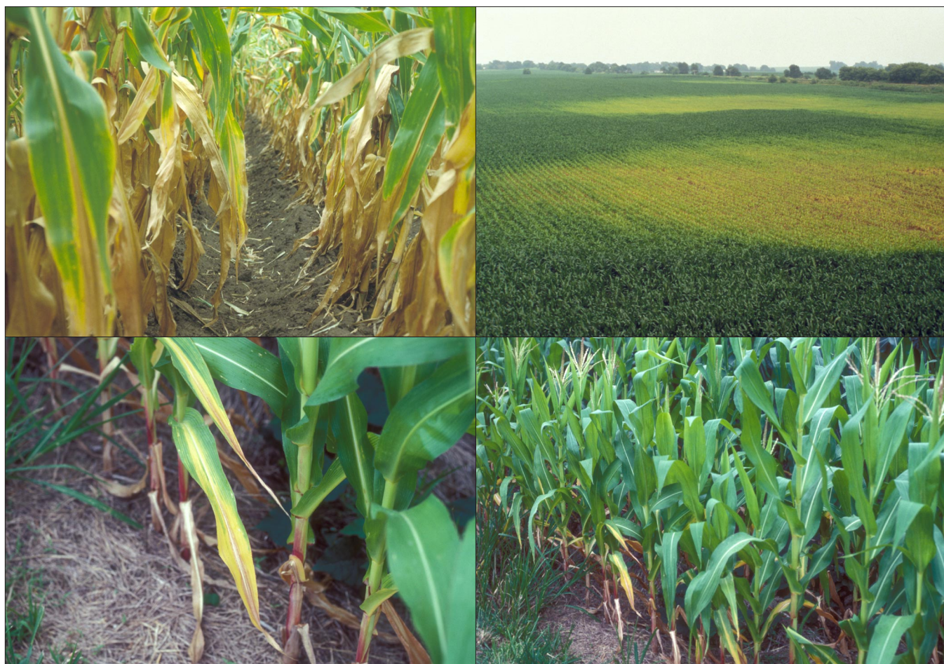
Nitrogen deficiency in corn

IOWA STATE UNIVERSITY University Extension