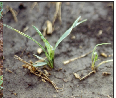
Seed-placed urea stand loss and biuret damage