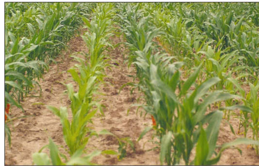
Nitrogen skip pattern in corn

Nutrient deficiency symptoms occur as yellowing of leaves, interveinal yellowing of leaves, shortened internodes, or abnormal coloration such as red, purple, or bronze leaves. These symptoms appear on different plant parts as a result of nutrient mobility in the plant.