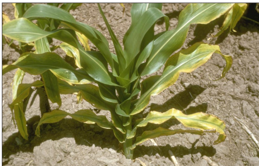
Potassium deficiency in corn, lower leaves

Symptoms caused by nutrients mobile in the plant occur on the lower, older leaves.