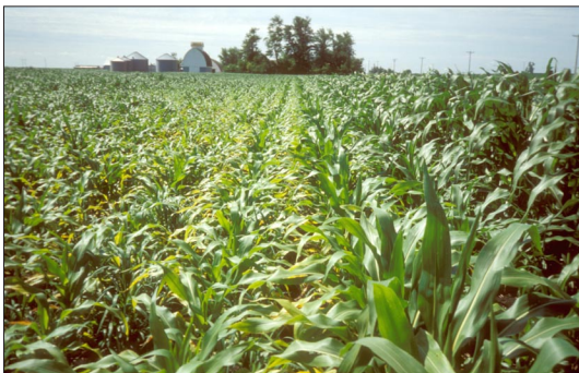
Potassium deficiency Not chiseled (left), chiseled (right)

Symptoms that occur in a regular geometrical pattern are most likely due to cultural practices.