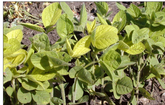
Iron deficiency in soybean, upper leaves

Symptoms caused by nutrients immobile in the plant occur on the upper, younger leaves.