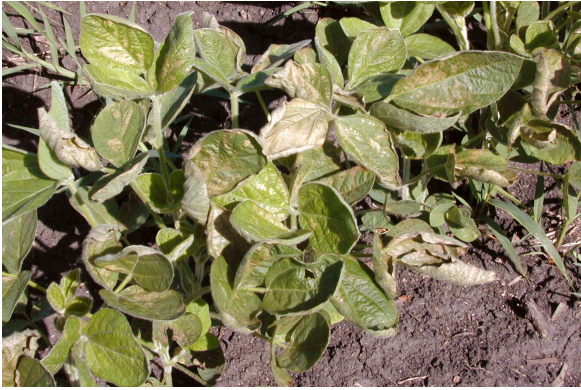
Broadcast nitrogen solution

Non-pressure nitrogen solutions (urea-ammonium nitrate solution, 28 or 32% UAN) broadcast on top of growing soybean can burn leaf tissue. Application even at low rates can cause tissue damage. Soybean plants usually outgrow the damage if only a portion of the leaves is injured.