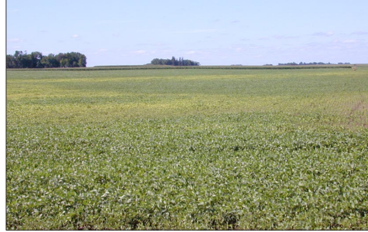
Iron deficiency in soybean

Symptoms that occur in a regular geometrical pattern are most likely due to cultural practices.