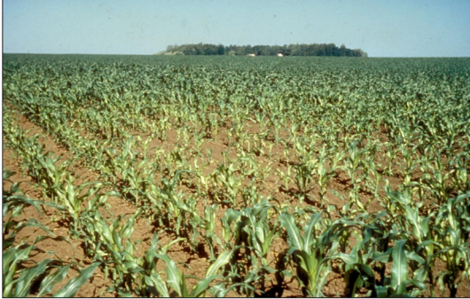
Zinc deficiency in corn

Nutrient deficiency symptoms that occur in irregular patterns in a field are probably due to a soil condition.