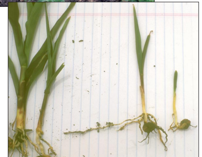
Anhydrous ammonia injury

of the root system is destroyed, it limits water uptake. Root injury browns the roots. If severely injured, roots die and turn black back to the seed.