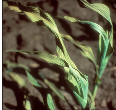
Anhydrous ammonia vapor damage

Anhydrous ammonia (NH 3 ) vapor damage to leaves can occur when sidedressing ammonia if the applicator knives are near or above the soil surface and there is escape of ammonia during application. Corn plants usually outgrow the damage if only a portion of the leaves is damaged.