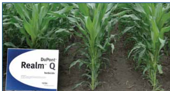
DuPont™ Prequel® 1.67 oz/A followed by Realm® Q 4.0 oz/A + COC + AMS. Iowa State University, Ames, Iowa. Photo taken June 21, 2010.