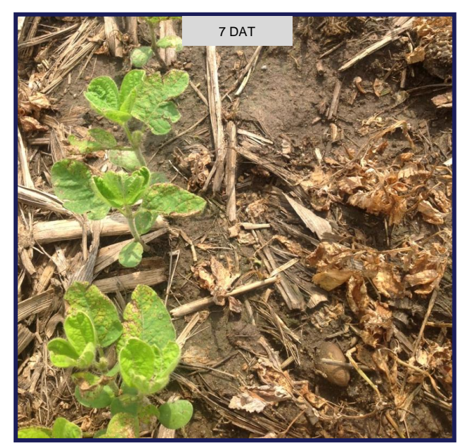
Anthem Herbicide @ 8 oz/a plus 32 oz/A of Durango® Herbicide

NIS – 1 qt/100 gal, or COC 1 gal/100 gal. When adjuvant loaded glyphosate herbicide or Liberty herbicide is used, additional adjuvant is not needed, but can be added if desired such as post-grass mixes. COC is recommended under dry or stressed weed conditions.