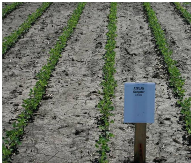
Gangster 2.4 oz/A