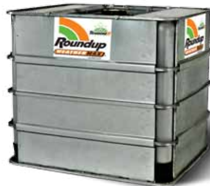
Monsanto internal test highlighting the surfactant loading of glyphosate competitors versus Roundup WeatherMAX herbicide.

High surfactant load of Roundup WeatherMAX Herbicide.