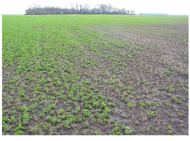
Figure 1. Alfalfa field with large winterkilled area.

Root issues - The best way to diagnose alfalfa winter injury is by digging up plants at several areas of the field and examining roots. The following table illustrates degree of root and crown injury to plants and discusses their chances for survival (Table 1).