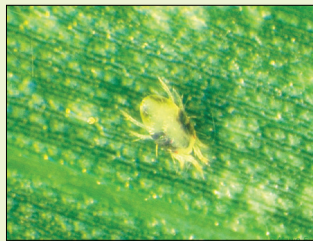
Two-Spotted Spider Mite