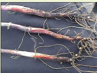
Rhizoctonia Root Rot