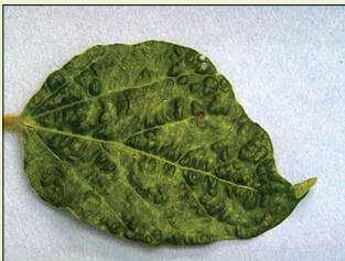
Bean Pod Mottle