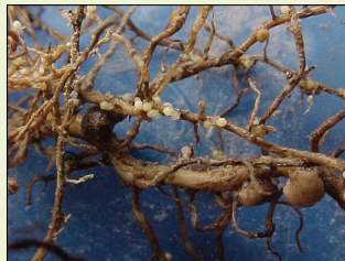
Soybean Cyst Nematode