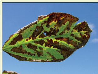
Brown Stem Rot