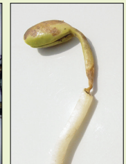
Pythium Root Rot