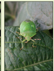
Green Stink Bug