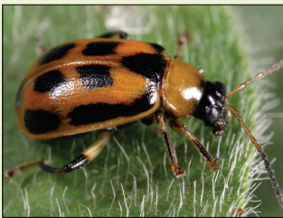
Bean Leaf Beetle

*Scouting information based on information from DuPont Pioneer, Iowa State University Extension, Purdue University Extension, University of Illinois Extension and the University of Kentucky Extension.