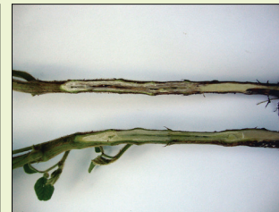
Phytophthora Root Rot