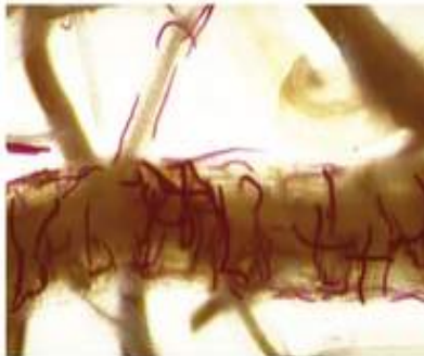
Nematodes on root - magnified